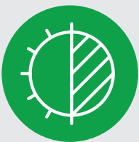
Low Light Levels

Boulevard Auto Group's dealership lighting levels were low, but their energy costs were high. They required a system that would cut costs without sacrificing lighting quality. Especially with theft on the rise at night, they needed bright lights around their lot that could double as a fail-safe in case of security camera malfunction.