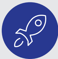
High Energy Costs