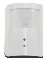
Wireless Occupancy Sensor, Ceiling Mount (WOS2-WM)