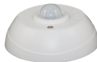
Wireless Occupancy Sensor, Ceiling Mount (WOS2-CM)