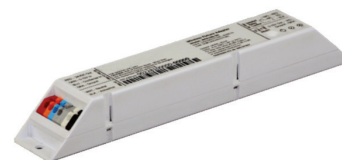
Wireless Fixture Adapter (WFA100-SN)